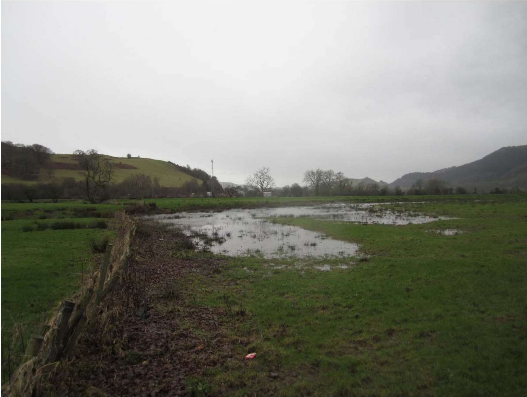
Photo 1: Rain and floodwaters standing in a meander scar on the floodplain south of the river and the proposed viaduct