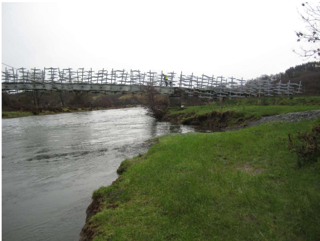
Photo 5: Looking upstream at eroded area of left bank immediately downstream of the Millennium bridge