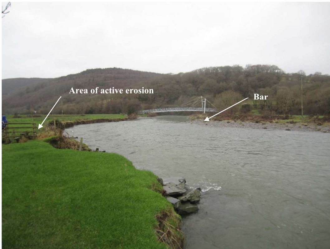
Photo 4: Looking downstream at coupled bar deposition and bank erosion resulting in lateral migration and the formation of a meander bend upstream of the Millennium Bridge