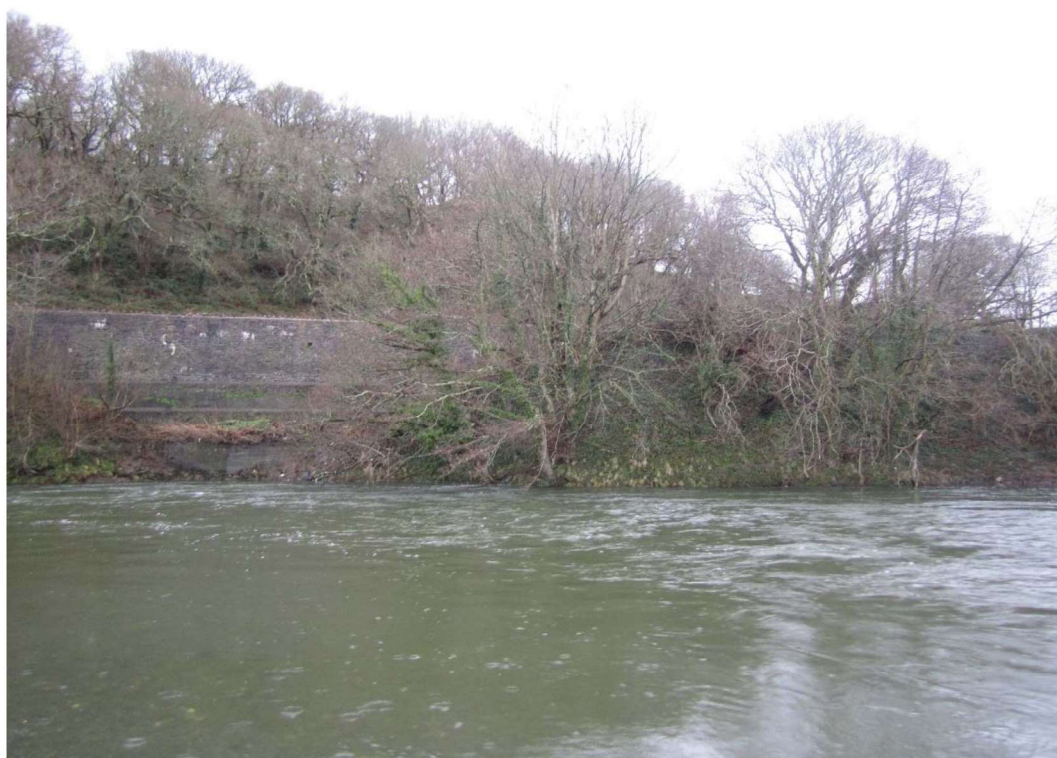
Photo 3: Outside of meander bend (right bank) showing retaining wall and steep bank with mature trees