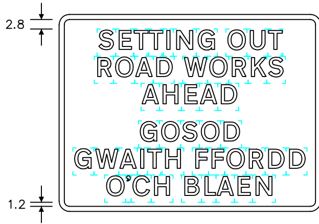
Variant (at reduced scale)