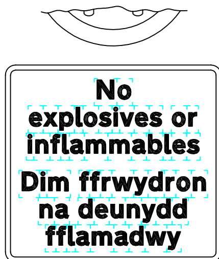
VARIANT (at smaller scale)