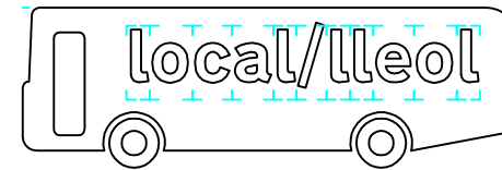
Variant for bus symbol

The legend 'local/lleol' is in Transport Heavy alphabet coloured black