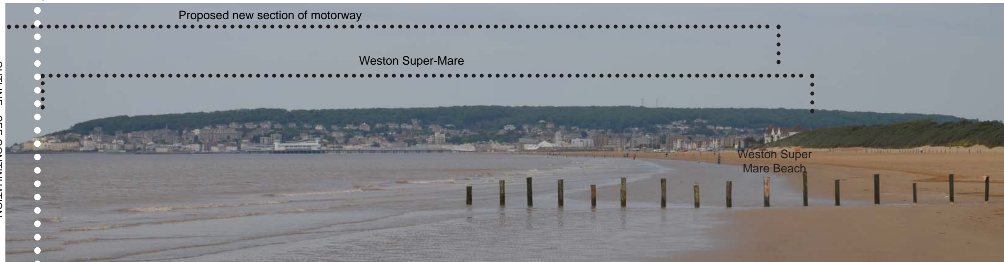
Viewpoint 92: Continued.