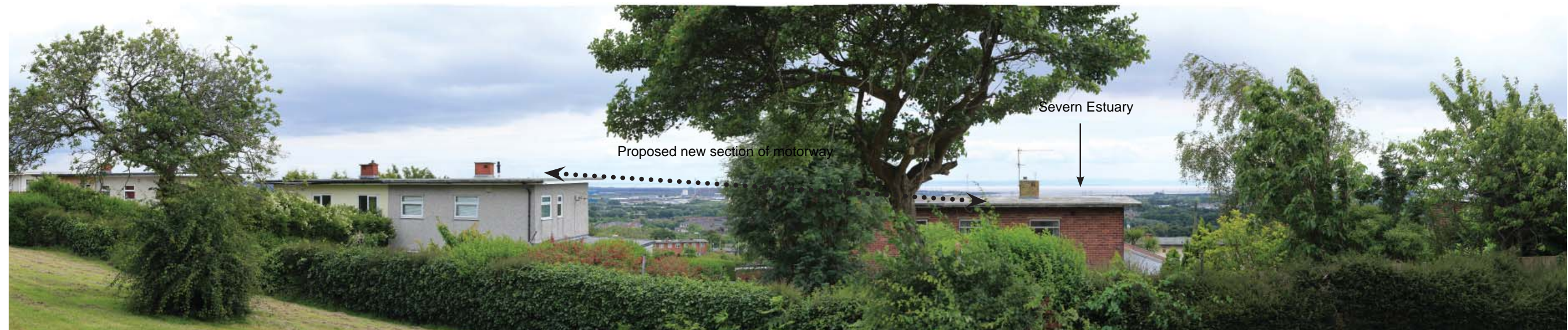
Viewpoint A7: View from Tatton Farm, on the track to the south of the farm looking south.