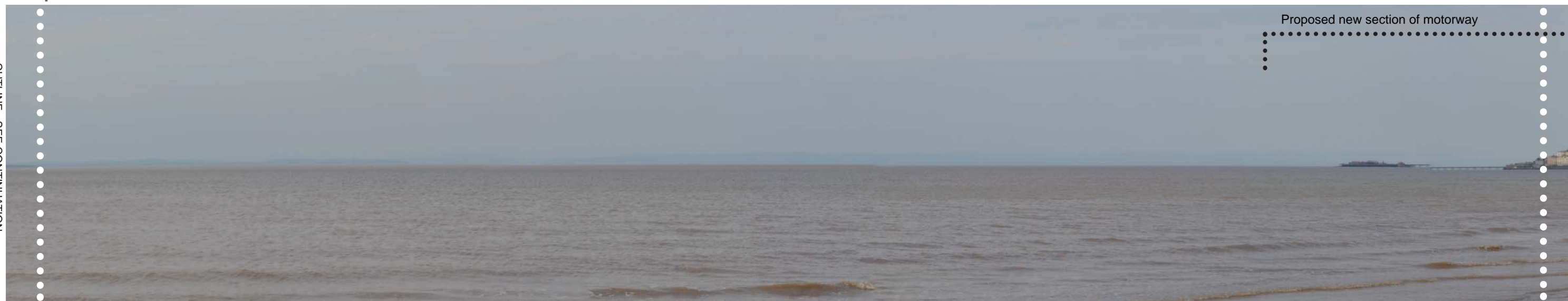
Viewpoint 92: Continued.