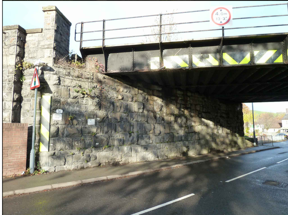
RAILWAY BRIDGE ABUTMENTS: DRESSED MASONRY BLOCKS, UNCOURSED