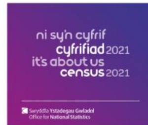
MPU – Bilingual