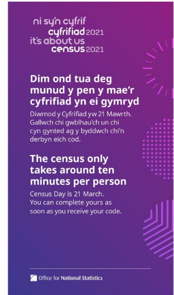
6s – Bilingual