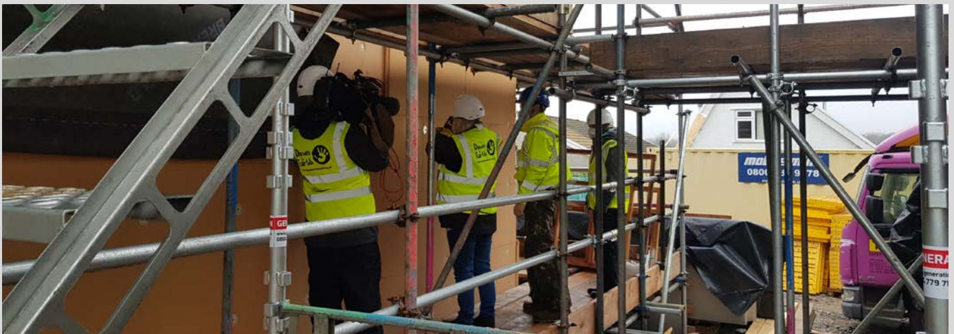
Down to Earth's 'Build Me Up' project