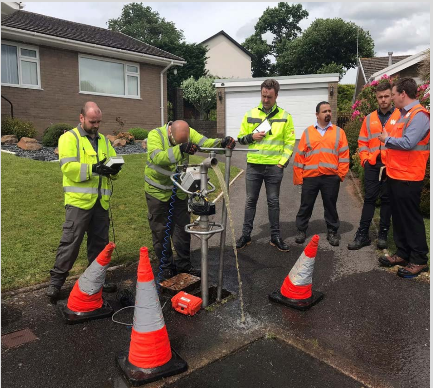
Circular Economy Innovation Communities (CEIC)