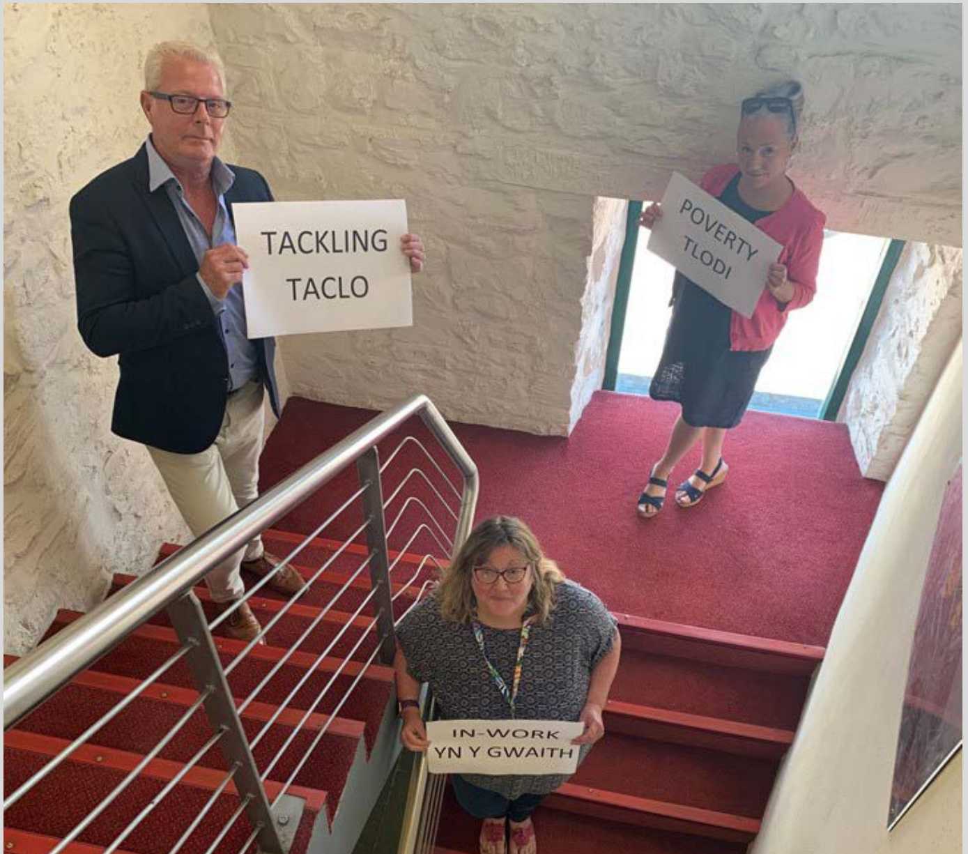
Tackling Poverty Pembrokeshire