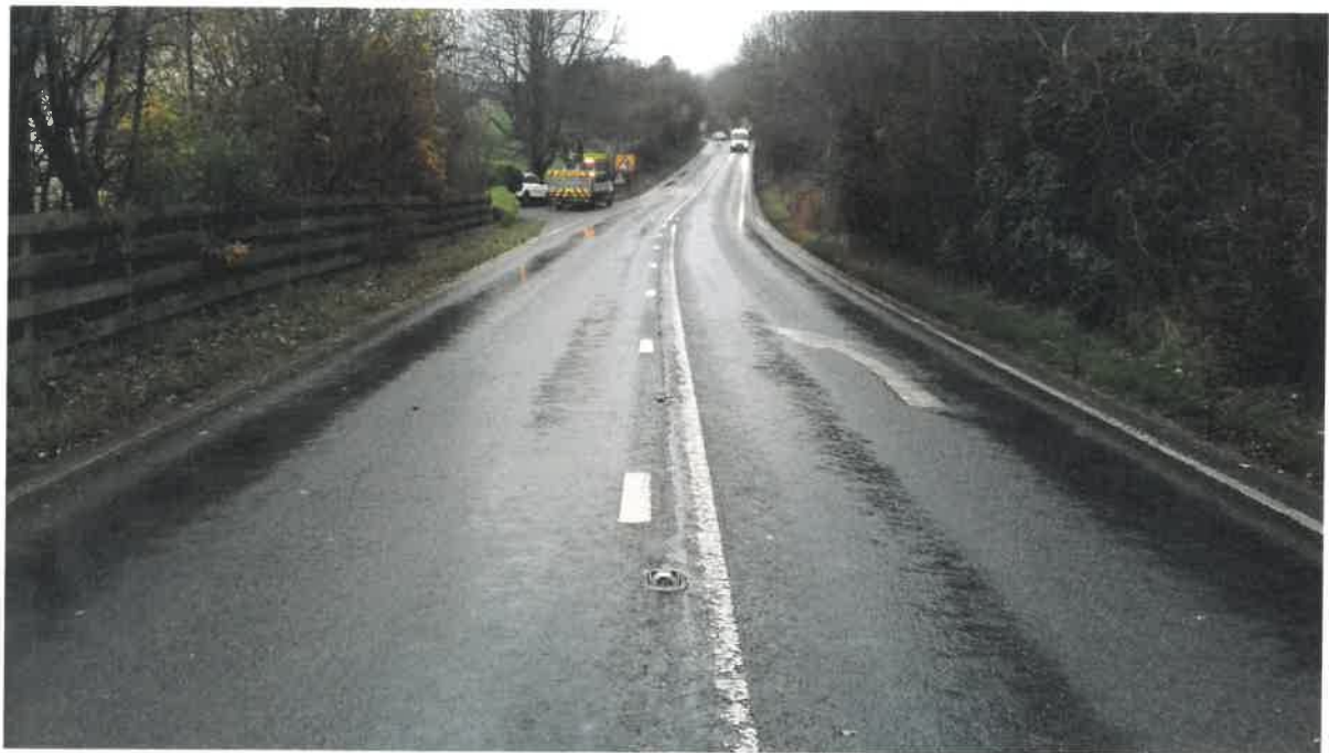
6. View southbound approaching site