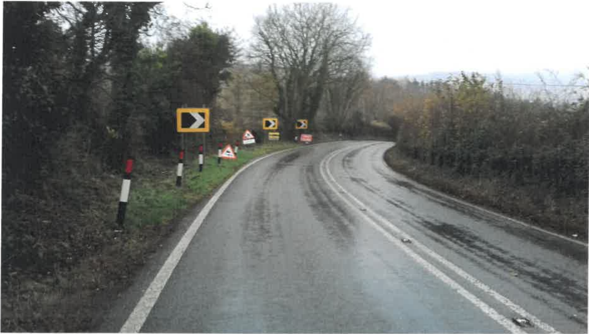
1. View northbound approaching site