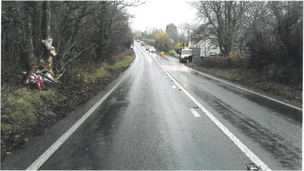
3. View northbound through collision location