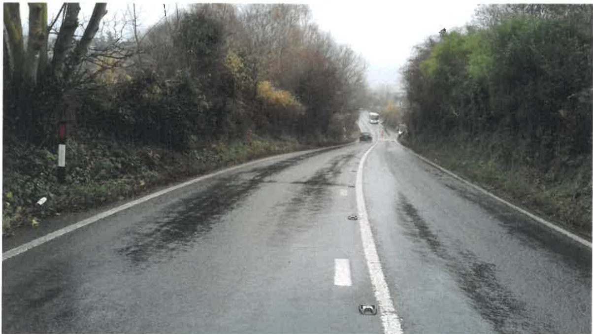
2. View northbound approaching site