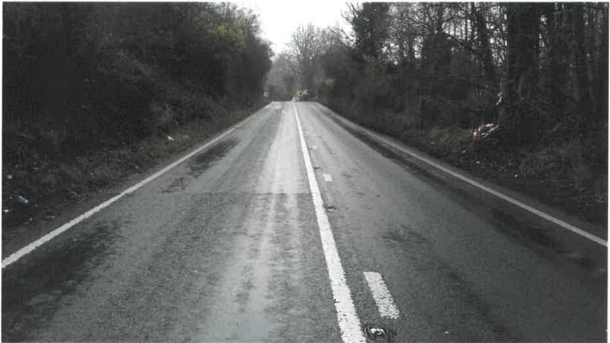
4. View southbound through collision location