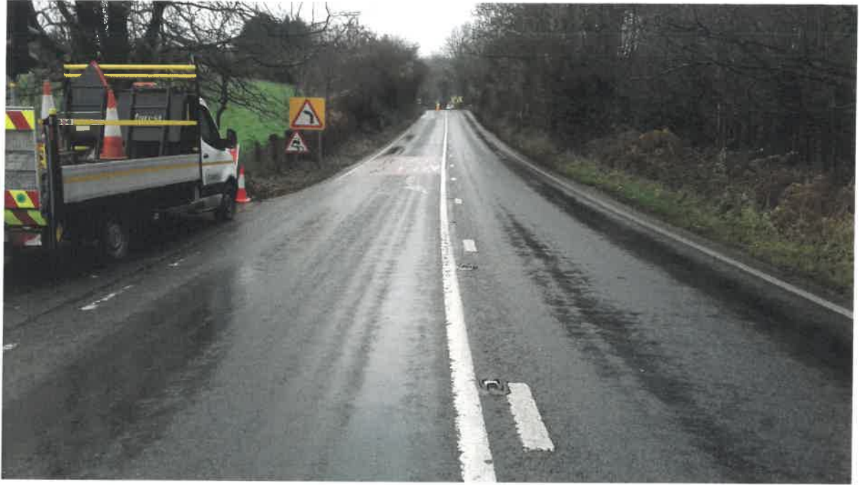
5. View southbound approaching site