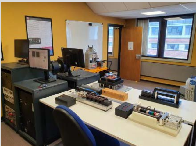
Magnetic Materials and Applications (MAGMA)