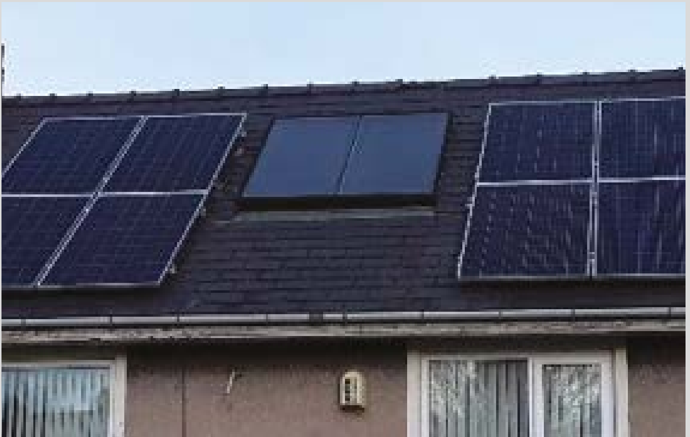
Solar panels installed through the Welsh Government's Arbed scheme

Despite the challenges of operating within Covid 19 restrictions, Arbed was able to improve the energy ratings of around 2,546 properties by March 2021, with an average household reduction in energy bills of £330.