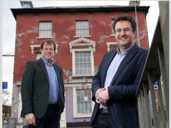
Wales Business Fund – PHG Consulting Cardiff