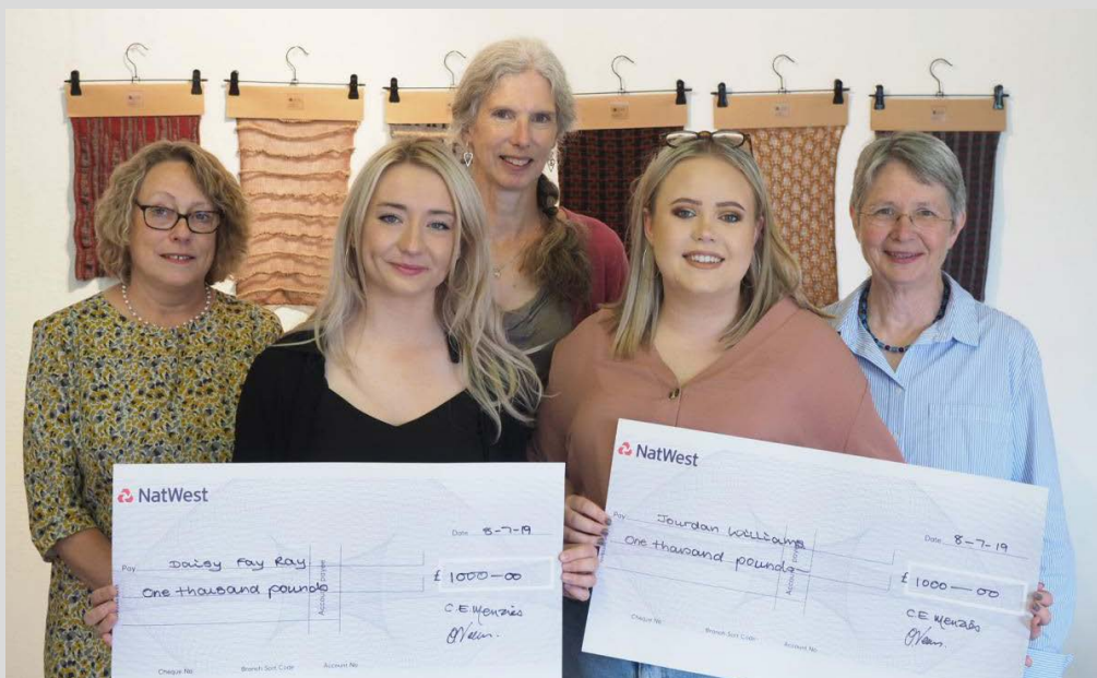
Business Wales – Wonderwool Bursary Award