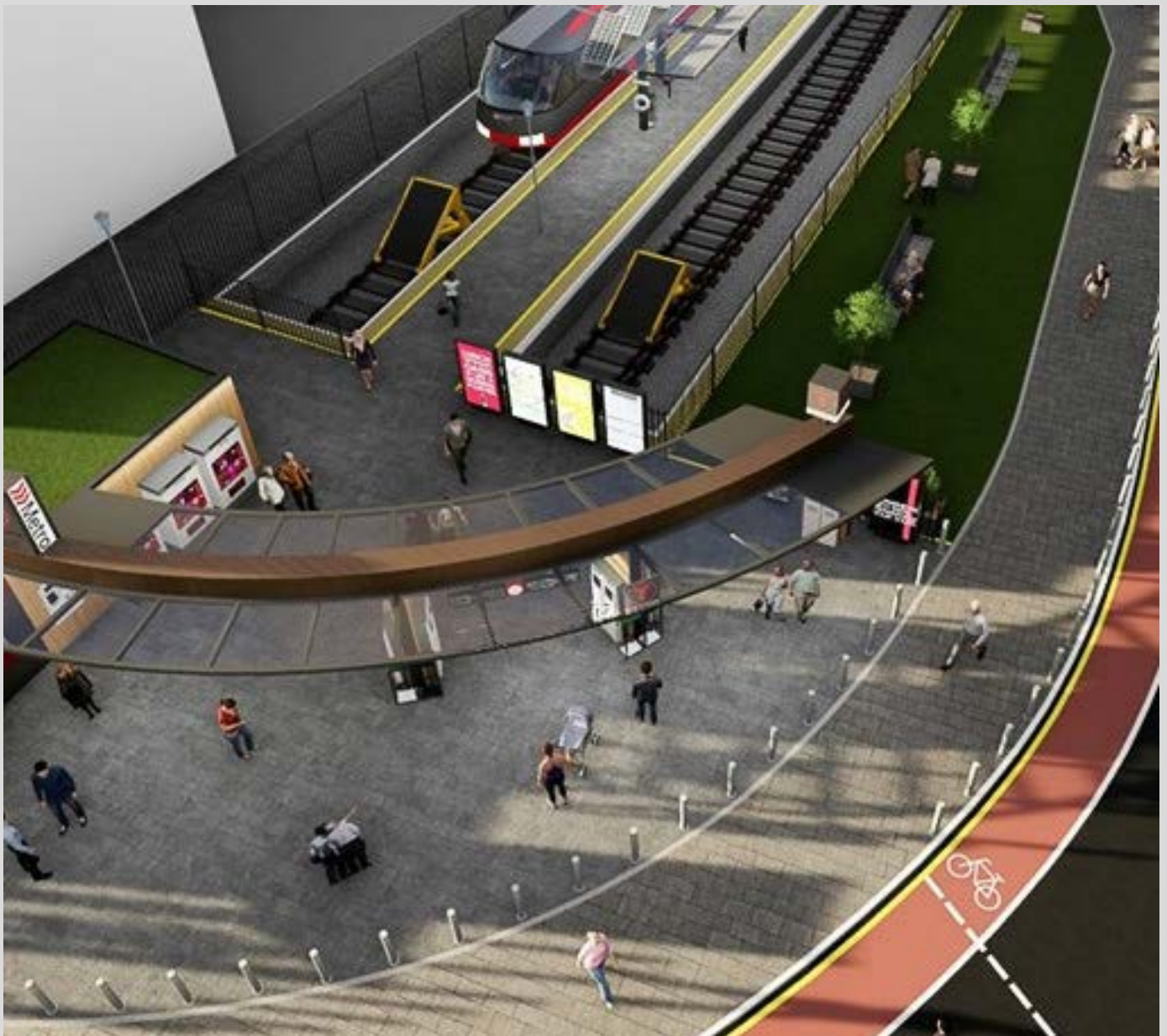
South Wales Metro (artist impression)

Despite the impact of the pandemic restrictions on the overall development of the Metro, design works are progressing well on the four operations in East Wales which involve a number of station improvements including capacity enhancements at Cardiff Queen Street and improvements to services into Cardiff Bay.