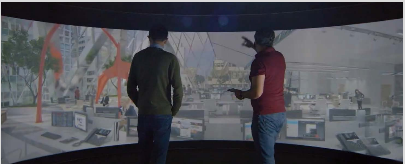
IROHMS Virtual Lab