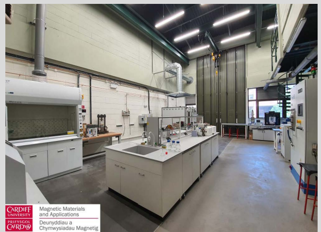
Magnetic Materials and Applications (MAGMA)