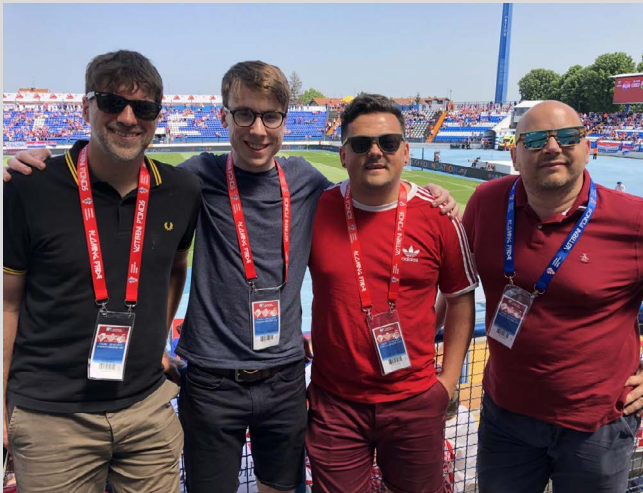
Business Wales – ESM Crew