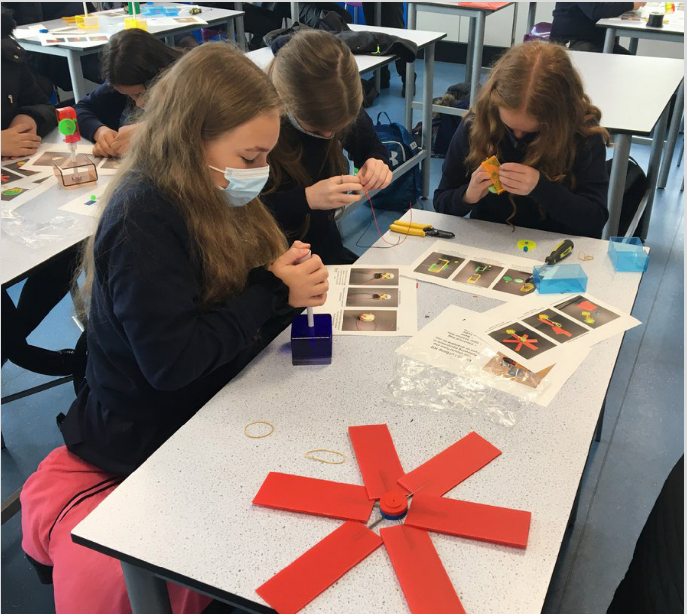
EESW STEM Cymru 2 Workshop