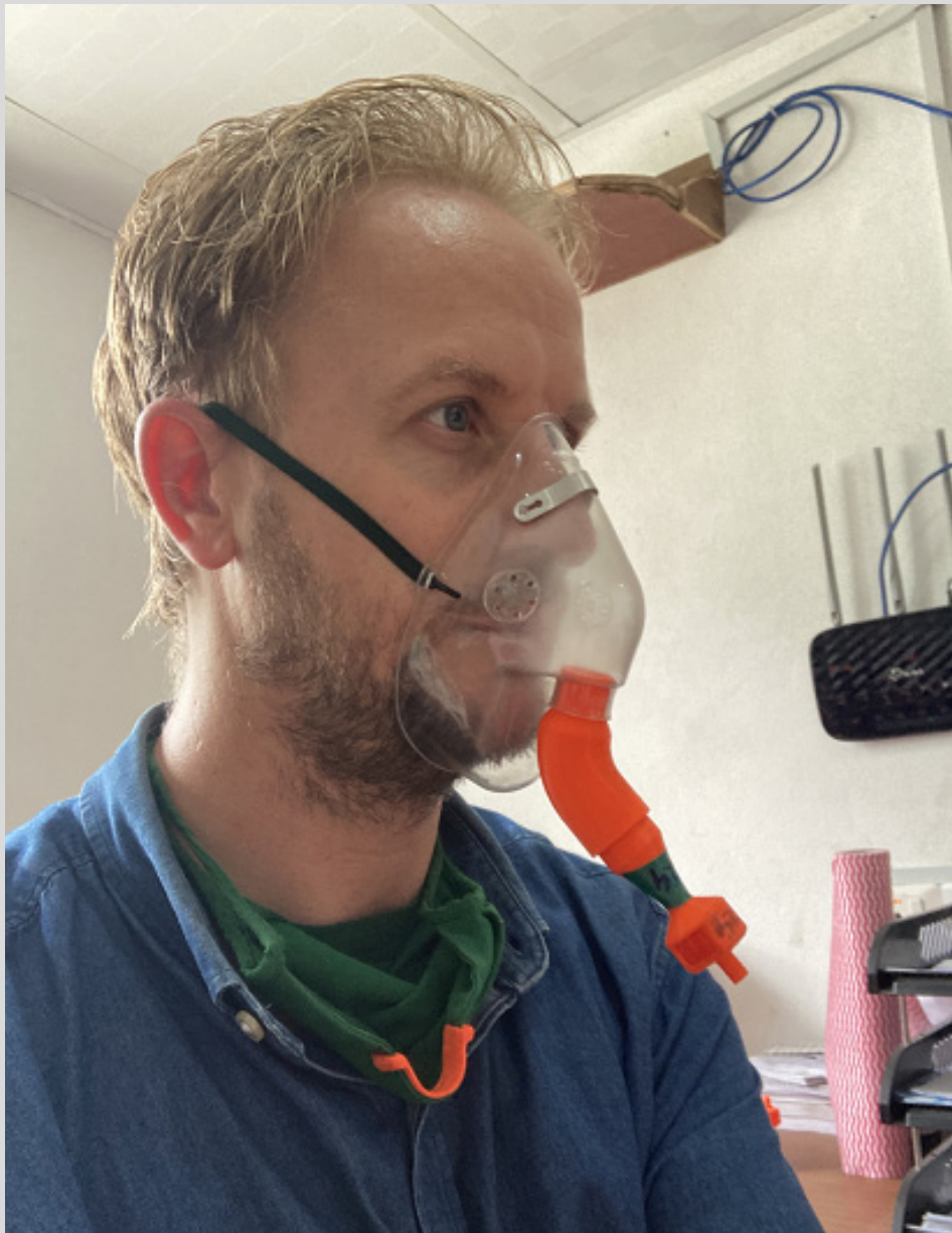
MADE Cymru respiratory support system