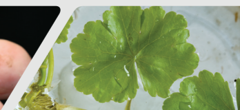
Dail-ceiniog arnofiol Floating pennywort