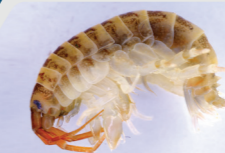
Misglen Quagga Quagga mussel