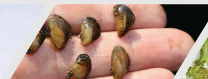
Perdysen Reibus Killer shrimp