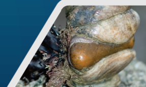
Ewinedd moch Slipper limpet