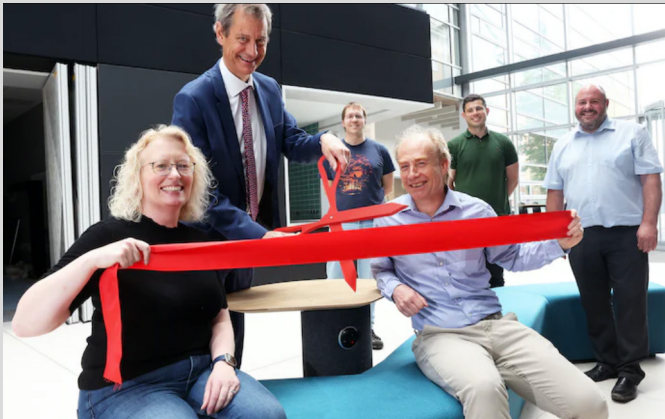
Opening of Cardiff University's Translational Research Hub