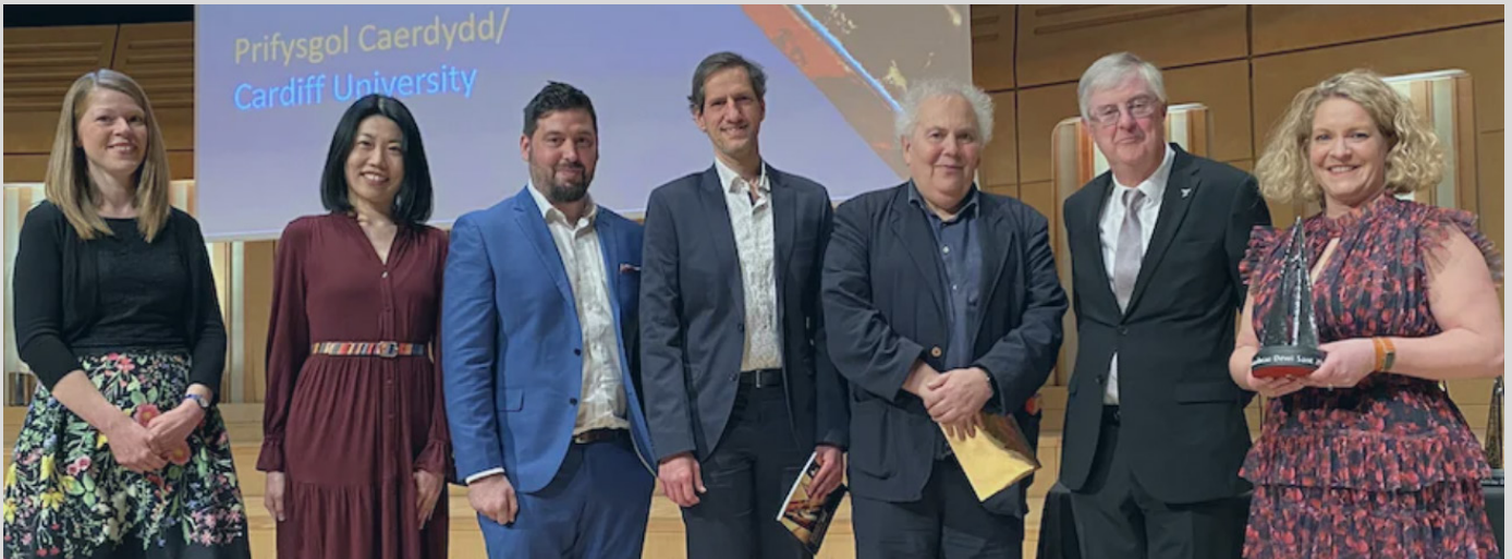
The Low Carbon Built Environment Team from Cardiff University receiving the St David Award