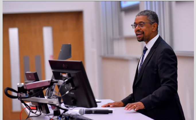
Minister for Economy attending Supercomputing Wales Symposium