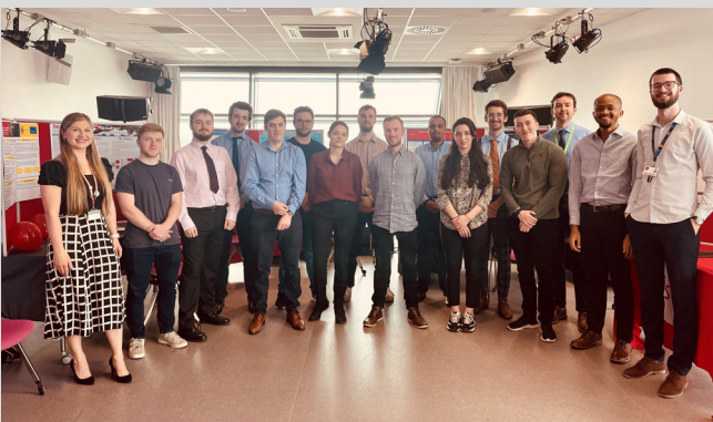
Data-AI Fast Track Graduates