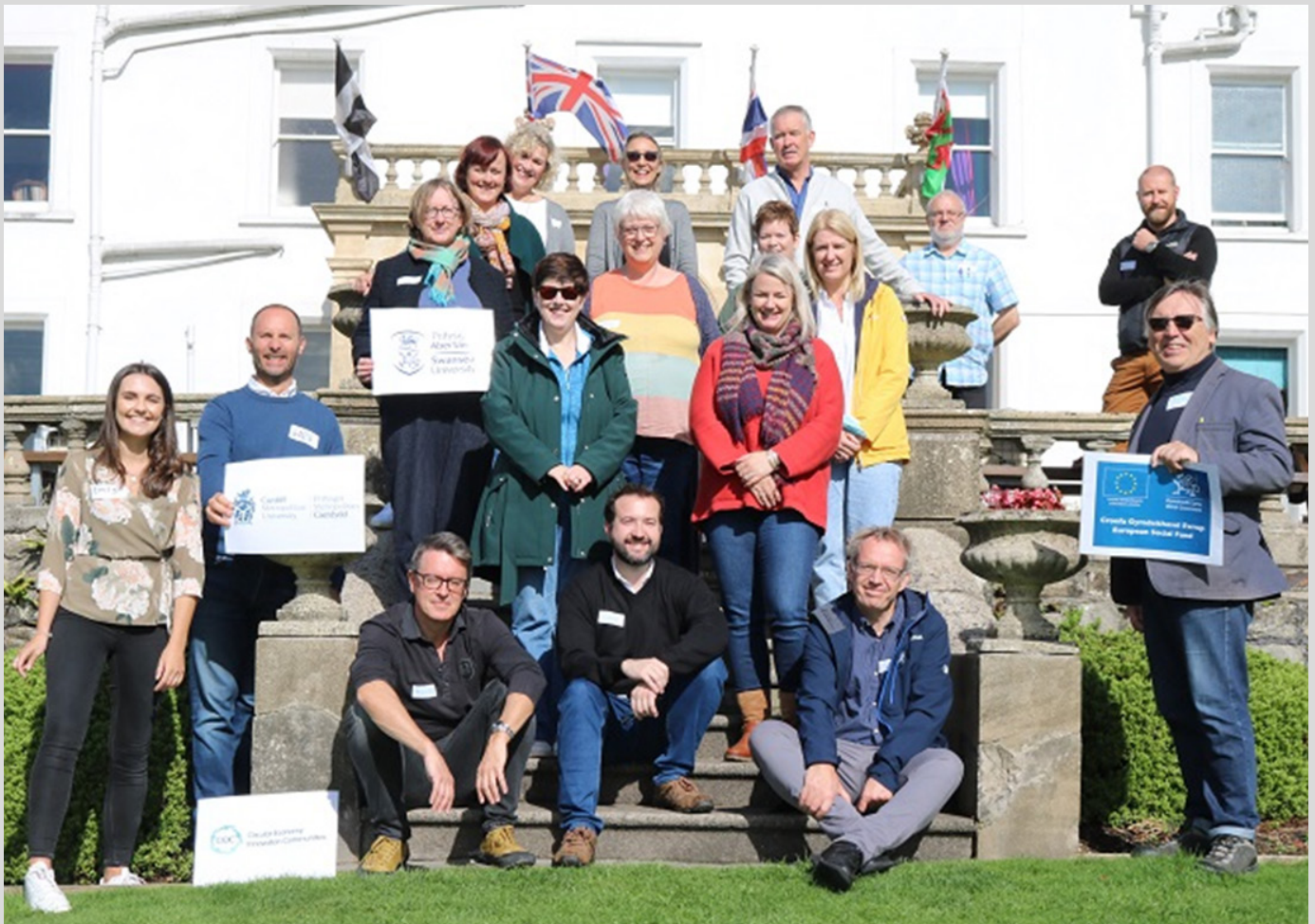
Participants of the Circular Economy Collaborative Innovation (CEIC) project

“The CEIC programme connected me with like-minded individuals who are passionate about integrating circular economy approaches into public services. I left it far more knowledgeable, both in regard to the effectiveness of social learning techniques, but also about how public servants in Wales can positively lead the way on sustainable development. It’s not easy, but then who doesn’t like a challenge!”