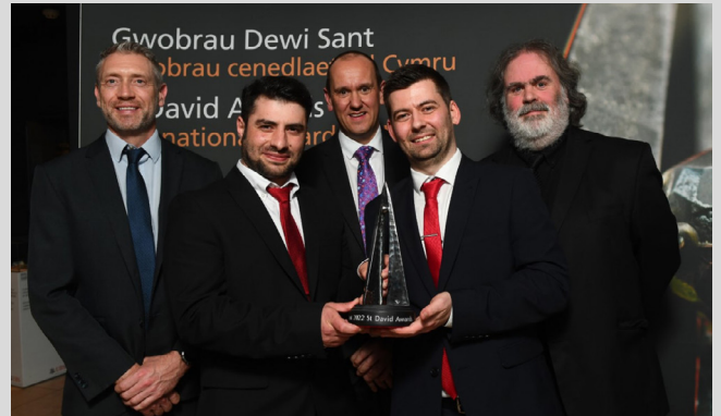
MADE Cymru receiving the St David Award for 'Innovation, Science & Technology'