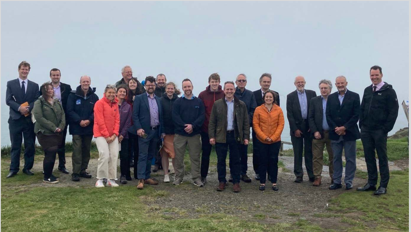
Deputy Minister for Climate Change visits Menter Môn's Morlais project

Through this latest investment, we will help provide a comprehensive package of essential data to support the development of this important project, safeguard marine biodiversity and make valuable insights available to benefit many other marine industries.”