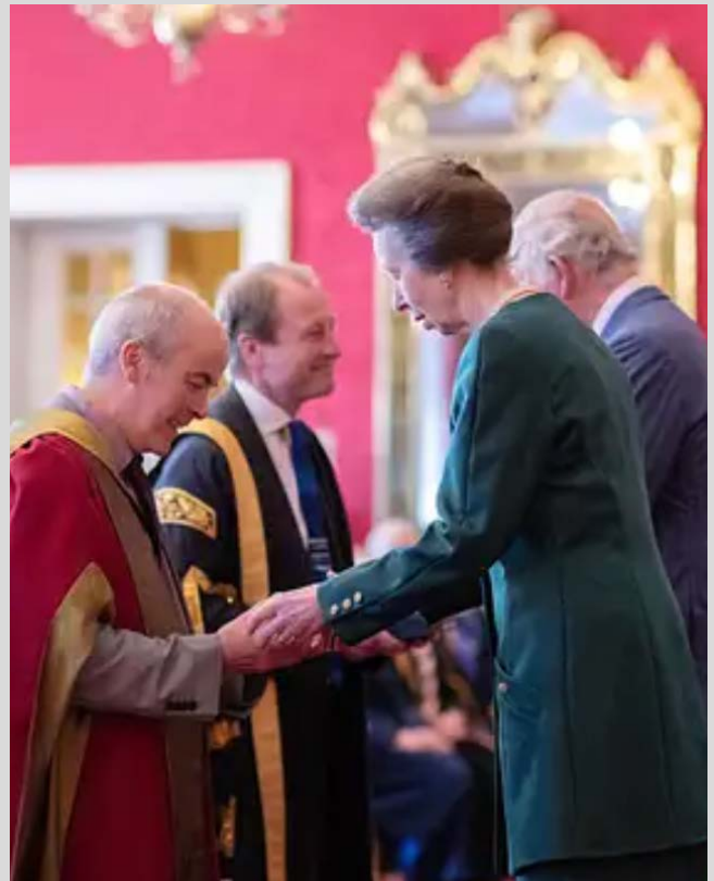
Swansea University receiving the Queens Anniversary Prize