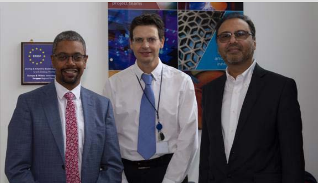
Minister for Economy visits TWI Wales