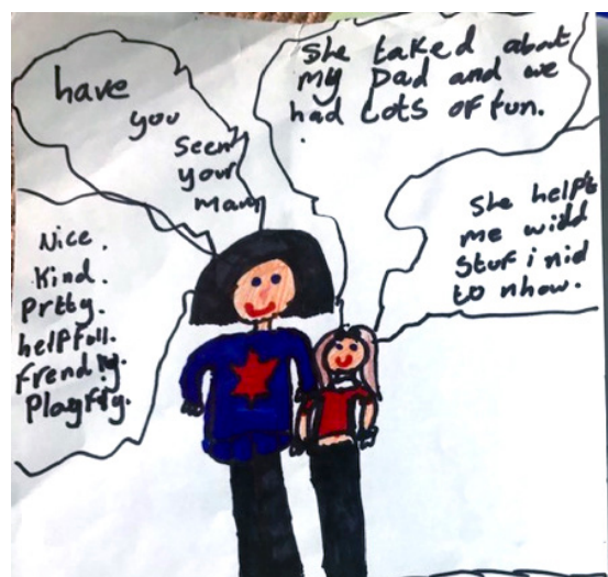
Drawing by child, aged 9

The children involved in the research gave positive responses about the intervention. The majority spoke of all the games and activities they liked to do, and of missing their worker. Seven of the children specifically said that their practitioner had helped them to feel calmer, or they liked them because they helped them to think or to feel differently about things, or they felt happier and they did not have worries anymore.