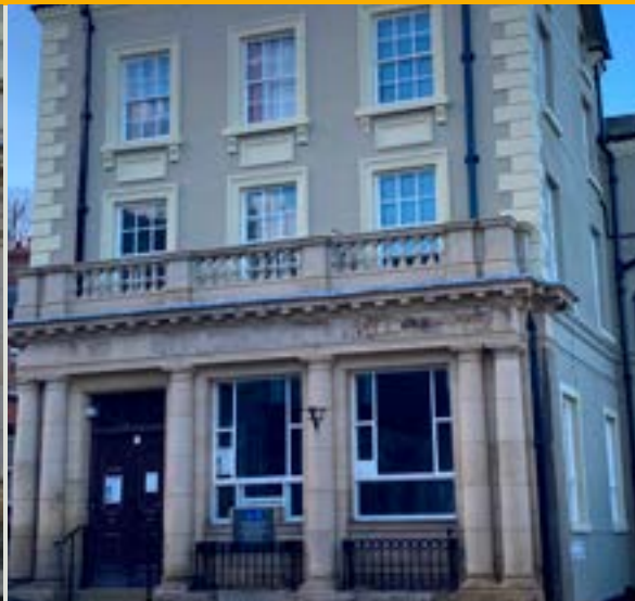
Denbighshire County Council and Partners

The Cabinet Secretary said, “This package project was developed as a part of a programme of wider improvements within the Dee Valley.